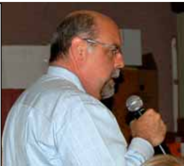
Jim suggests that the best investments at this time are those dealing in "essential services" such as water, oil, telecommunications and -- cemeteries.

Look for inflation to rear its head once again, probably in 2010. Jim remains cautiously optimistic with a quote by the recently departed newsman, Walter Cronkite: