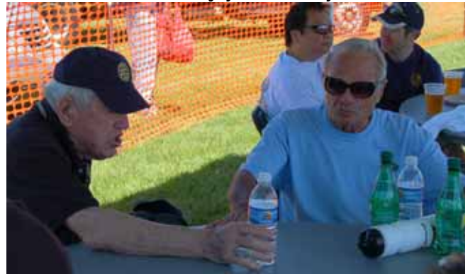
... but they're enjoying the ambience of the Napa Rotary "hospitality suite."