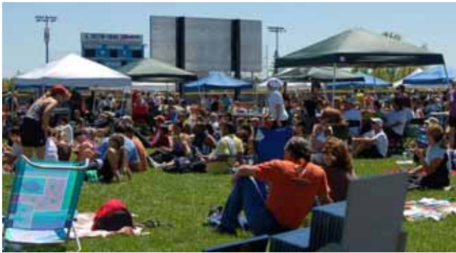
It was a party for some 1,700 cyclists, revelers and volunteers ...