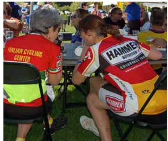
These two are definitely cyclists!