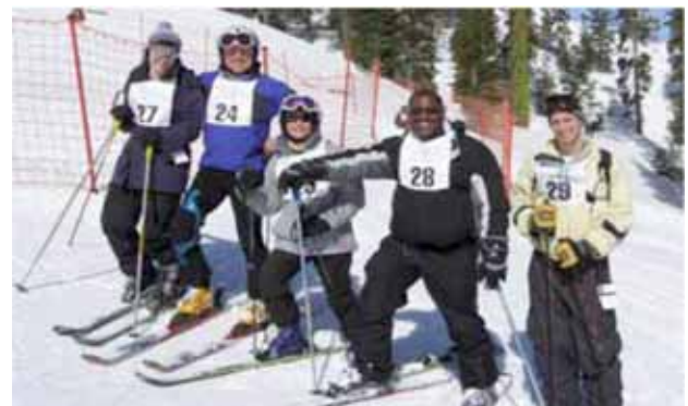
Recognize these hearty souls? It's the Rotary ski team at the February jaunt to Tahoe.