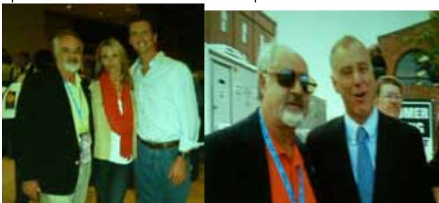
Henry rubbed elbows with a lot VIPs, seen here with Mayor Gavin Newsom and Demo party head, Howard Dean.

The complexion of the two conventions also was marked by contrast. Michalski said female and minority representation were much more prevalent in Denver.