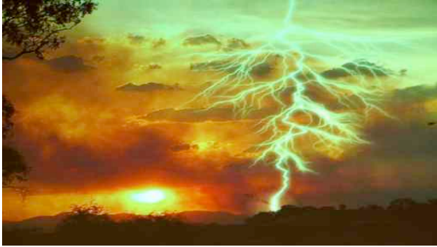
Lightning caused most of the 1,459 fires.